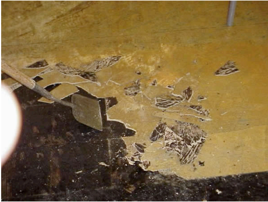
Photo #7 - The floor tile was removed using an ice chipper and is friable. Floor tile being removed in this manner must be removed according to the MDH Asbestos Abatement Rules.