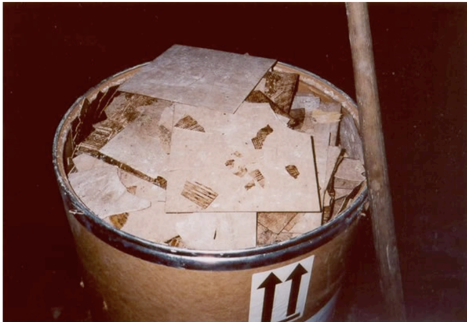
Photo #8 - The floor tile in this picture may have been removed nonfriably and then placed in a lined fiber drum. The work crew used a hand tool to break up the floor tile in order to fit more into the drum. The floor tile has now become friable during the handling process. The floor tile needs to remain nonfriable from removal until it is disposed of.