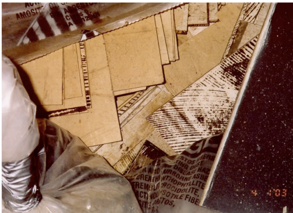
Photo #2 - This asbestos-containing floor tile was removed with an ice chipper. The tile remained in whole pieces with little breakage.