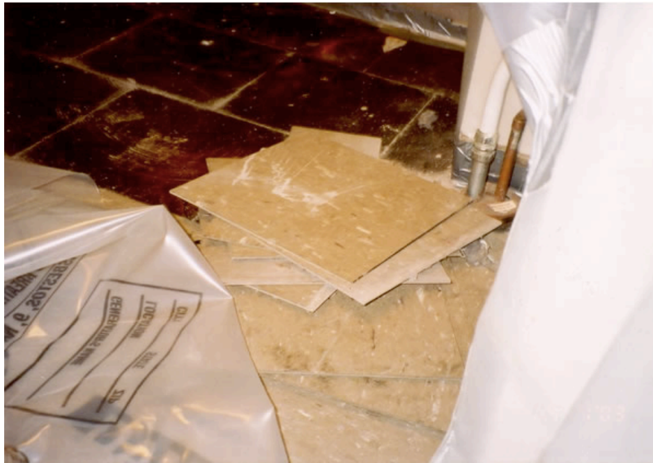
Photo #1 - This asbestos-containing floor tile was removed using a putty knife and a hammer. The tile remained in whole pieces with little breakage.

The following series of pictures of floor tile removal projects is for illustrative purposes. The floor tiles in all these pictures were removed using hand tools by licensed asbestos abatement contractors.