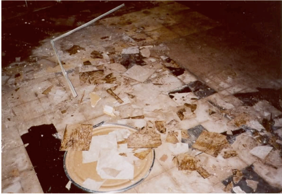
Photo #9 - The floor tile in this picture may have been removed nonfriably. Even though the floor tile was removed as a nonfriable material, it has the potential to become friable during the handling process. The floor tile needs to remain nonfriable from removal until it is disposed of.