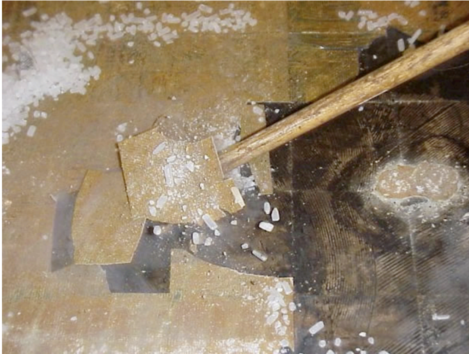
Photos #3 & #4 - The asbestos-containing floor tile in these photos was removed with dry ice and an ice chipper. Too much breakage is occurring to the floor tile. MDH recommends reviewing and/or modifying work practices to reduce breakage.